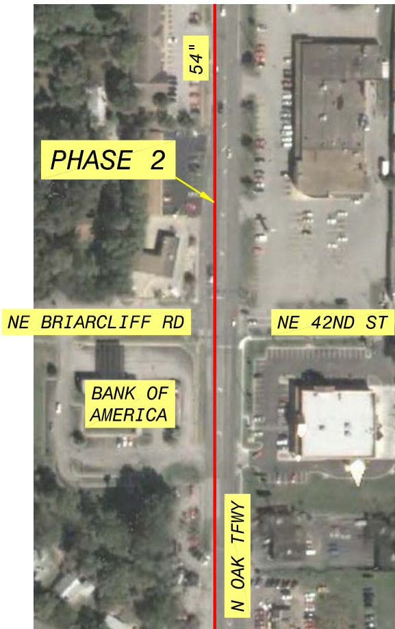
NE 42ND ST INTERSECTION