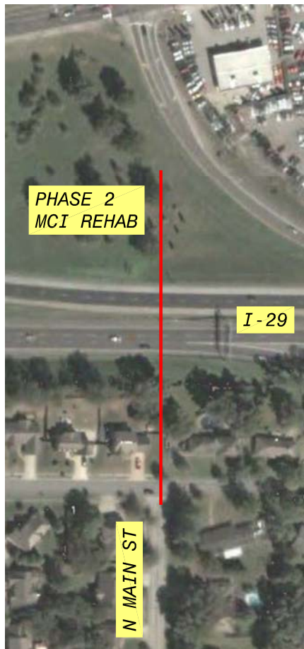
NORTH MAIN ST REHAB