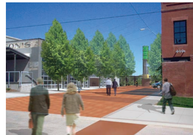
View of proposed intersection at 2nd Street and Walnut Street.