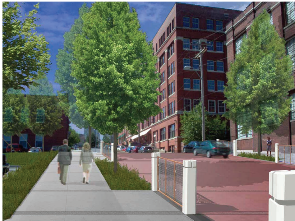
View of Main Street north of 2nd Street.